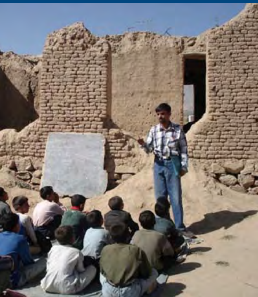
Students attending an open class in Kabul in 2007. Hundreds of schools have been shut owing to attacks on education mostly in southern provinces, according to the ministry of education.

At the ILO's Global Dialogue Forum on the financial crisis workers, government and employers agreed that "restructuring should be based on dialogue between management, unions and workers' representatives". 3 This dialogue is at the core of active labour market policies – yet to date only a tiny part of money in the massive bail-out and stimulus plans of governments is directed towards such policies. Any company receiving public money should be obliged to